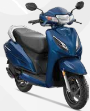
Decent Blue Metallic