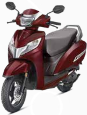
Rebel Red Metallic

GS Dream Honda 72/8, Chak Raghunath Prayagraj Tel: 9415344758 Mob: 9565500013