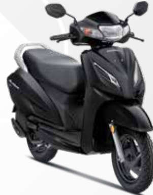
Pearl Igneous Black