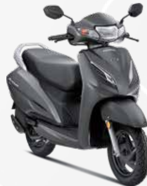
Mat Axis Gray Metallic