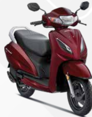
Rebel Red Metallic