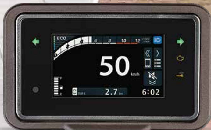
All New ACTIVA 125